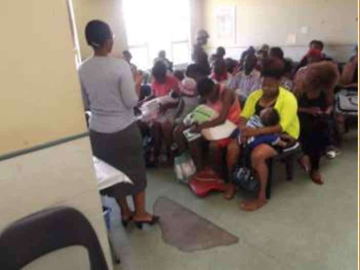
The Isipingo Community Service Office Child Protection Program at AA Clinic

he term "prevention" is typically used to represent activities that stop an action or behaviour. It can also be used to represent activities that promote a positive action or behaviour. Research has found that successful child abuse interventions must both reduce risk factors and promote protective factors to ensure the well-being of children and families.