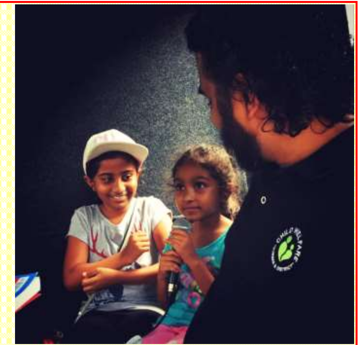
CWDD supporters challenging their peers on air