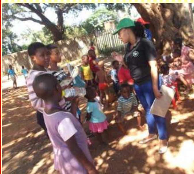
Giving Childhood to Children, One Community at a Time

Our Social Workers conduct Child Protection programmes in the schools, clinics, hospitals and in the communities. Life skills programmes are held for adults and children. Parenting programmes are also held for all parents in the communities.