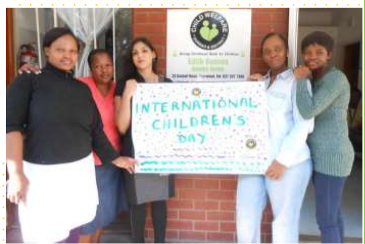
EBBH staff members