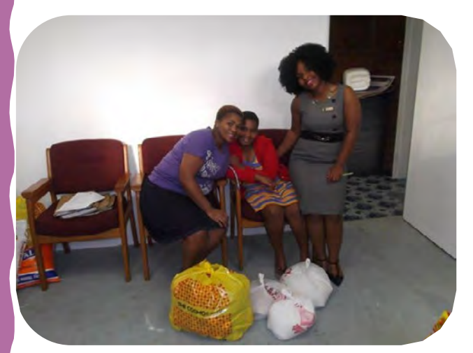
Social Worker handing over food hampers to members of the community