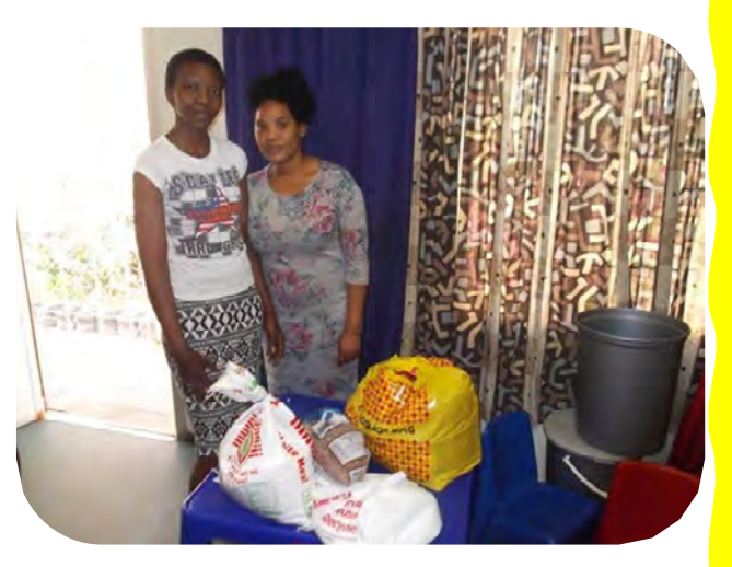
Social Worker handing over food hampers to members of the community

CWDD says a big Thank You to the Dukes Combo Committee on behalf of Dukes Combo Live in Concert for their generous donation generated from the live concert performances.