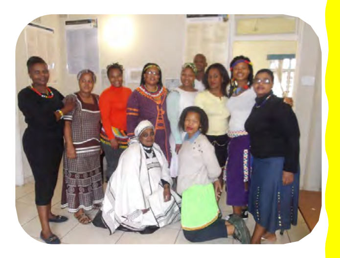
Staff at the Lamontville and Isipingo Service Offices