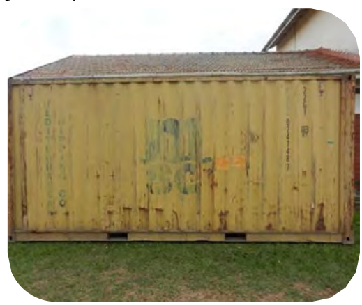
Above: Storage container at Lakehaven CYCC

CWDD would like to Thank Mediterranean Shipping Company (MSC) and Container World for their instrumental donation of storage containers to Lakehaven/Zamani Child and Youth Care Centre and Stormhaven offices respectively.