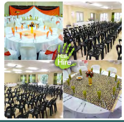
August - October 2016

Looking for a venue for a baby shower, Birthday Party, Family gathering or even a wedding? CWDD William Clark Gardens/Othandweni Child & Youth Care Centre Hall is your answer. The hall can accommodate 150-200 people. It provides the perfect ambience for any event you are hosting.