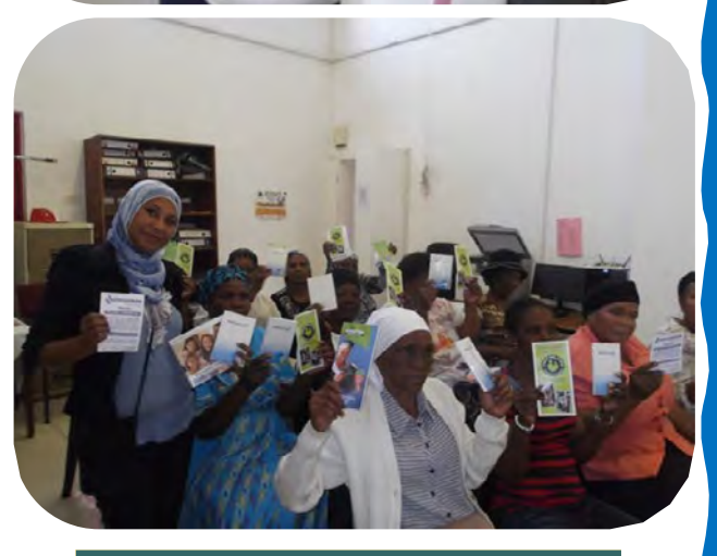
"There is no tool for development more effective than the empowerment of women" - Kofi Annan