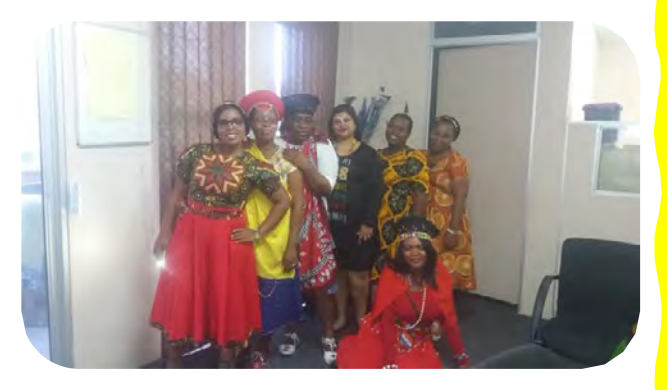
Staff at the Umlazi Service Office