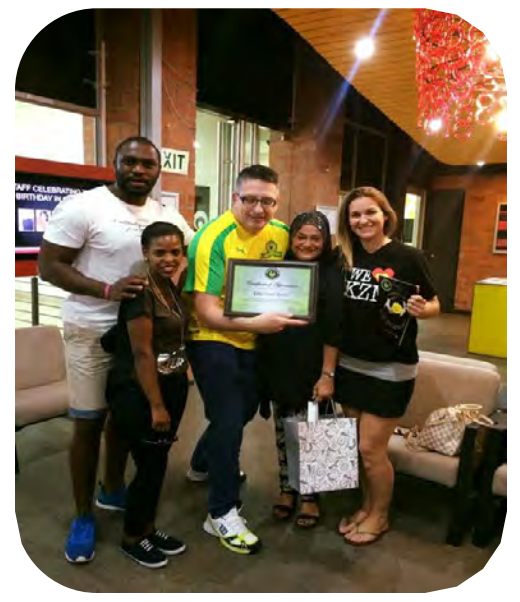
East Radio Breakfast Team is presented with a token of appreciation.