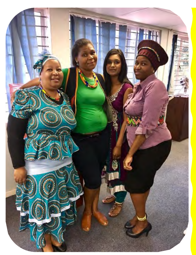
Staff at Stormhaven