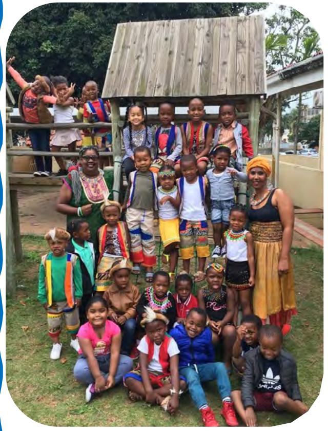
Thokozani Children and Staff

In the spirit of Heritage Day, children at Thokozani Educare Centre and staff at CWDD were dressed to impress in their traditional best to commemorate the many cultures that make up the population of South Africa.