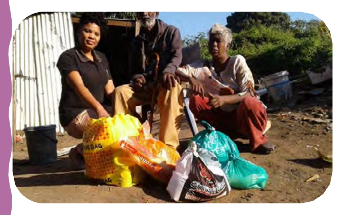
Social Worker handing over food hampers to members of the

The donations also assist our beneficiaries within the communities we serve by providing much needed emergency relief in times of crisis.