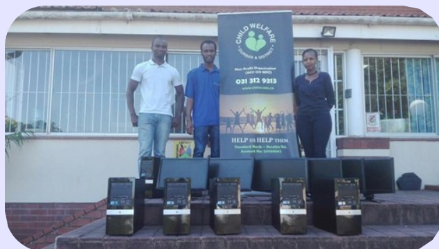
Kingdomslots handing over donated computers

Computer donations provide a substantial source of much needed educational and vocational assets that will be used for the betterment of our children. CWDD would like to Thank Kingdomslots for their kind donation of computers for our children at William Clark Gardens/Othandweni Child and Youth Care Centre.