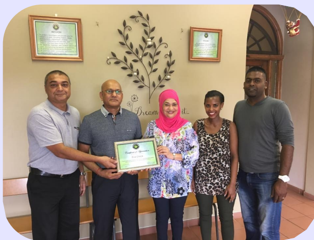
Certificate of appreciation handed to Fire Check

CWDD is grateful to Fire Check for servicing our Fire Equipment probono at all our sub-offices, community homes and residential facilities.