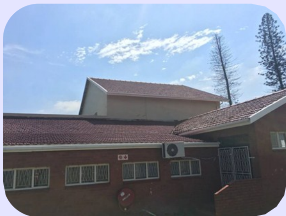
Above: Admin roof painted

CWDD would like to Thank the Victor Daitz Foundation for their instrumental contribution towards the renovations of our Administration Block and the addition of Jojo Tanks and pumps at Cottages 4 and 5 at Lakehaven/Zamani Child and Youth Care Centre.