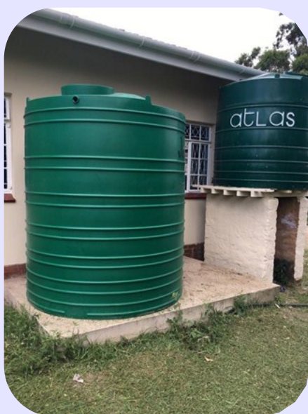
Below: Jojo tanks installed at Cottage 5 at Lakehaven CYCC

Ongoing maintenance on fire equipment is vital as it ensures that the equipment that is in place is ready to address any fire emergency. By servicing and maintaining all the equipment on our sites we can ensure the safety of our children, staff, visitors and our premises.