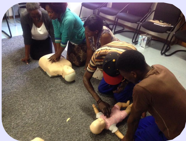
Staff at EBBH practising CPR

Staff of Edith Benson Babies Home (EBBH) cares for 60 children (between ages 1-5) on a daily basis. The staff were equipped with CPR training which lends to the safe environment which we aim to create for our children, the training was provided by Enpower Training Services.