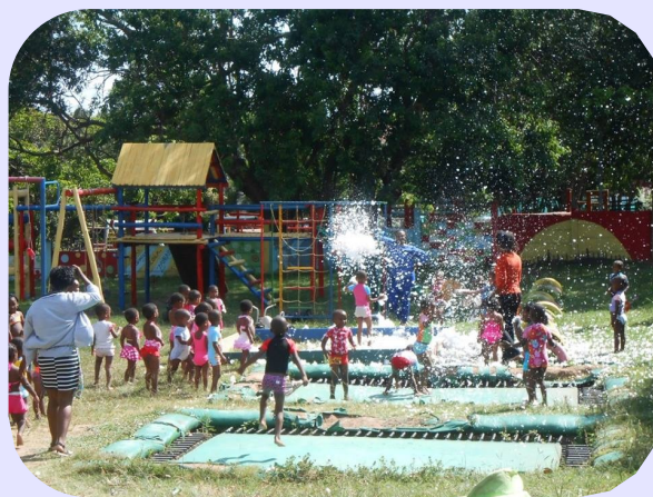
Children at EBBH playing with the bubbles