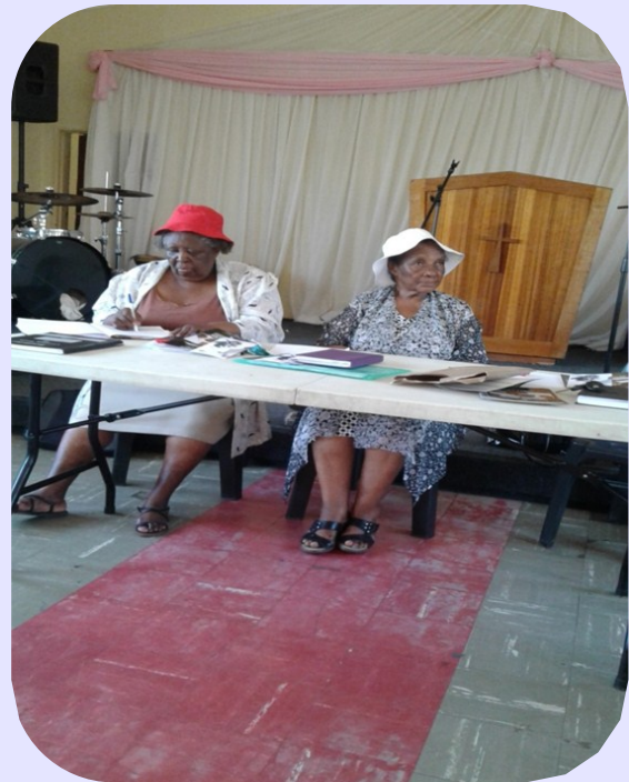
Members of the congregation