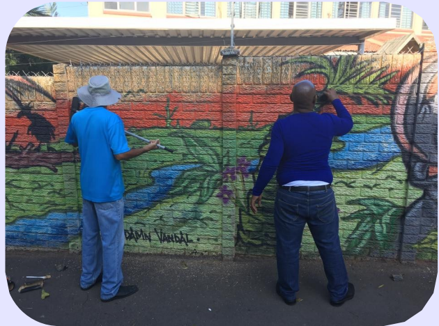
Painting being done out Thokozani

Our Thokozani Educare Centre would like to Thank Staff from the South Africa Sugar Association for volunteering through the Ubuntu Community Chest Day of Caring initiative. The Day of Caring initiative culminated in the painting of the exterior perimeter walls of Thokozani Educare Centre.