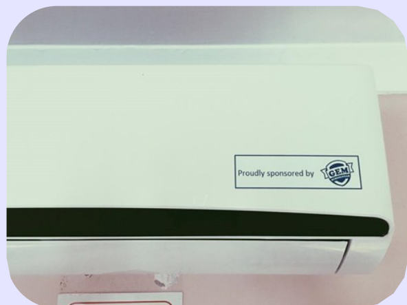
Air conditioner sponsored by Gem Schoolwear

Gem Schoolwear donated an air conditioner for our William Clark Gardens CYCC Hall which adds to the impressive features of the facilities resulting in more hall hiring bookings as well as benefiting our children during their activities in the hall.