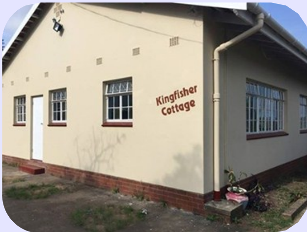
Cottage 5 - Exterior painting completed

Azcon Projects contributed their valuable time, effort and resources towards the renovations of Cottage 5 at Lakehaven/Zamani Child and Youth Care Centre.