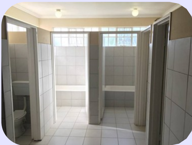
Cottage 5 - Tiling completed

CWDD would like to Thank Momentum for their heartfelt contribution towards the external renovations and painting of Cottage 1 at Lakehaven/Zamani Child and Youth Care Centre.