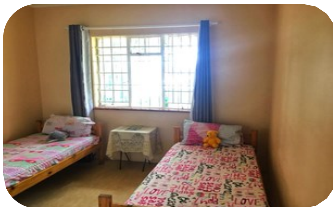
WCG CYCC: Cottage One Bedroom