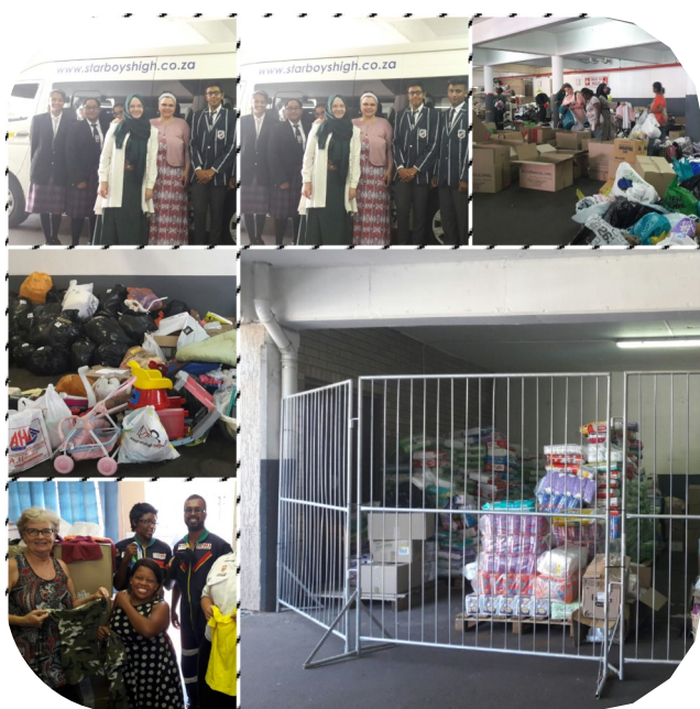
Donations received from the community

“Kindness is free, sprinkle that stuff everywhere”