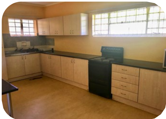
WCG CYCC: Cottage One Kitchen

Renovations of our cottages at our Child and Youth Care Centres (CYCCs) help improve the quality of living for our children in our facilities. This is all made possible by donor considerations.