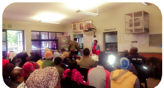
Attendees at Isipingo Clinic

An informative Community Outreach programme was launched to raise the Awareness of Child Abuse and Bullying in our communities. The programme was well received by the community and enhanced the communities perception of these issues.