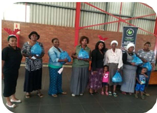
Seen here: Foster parents and children

A Holiday Programme with foster parents and foster children held at Umlazi V Section Community Hall, Umlazi Township by our Umlazi Team One. The programme was aimed at equipping foster children with life skills necessary to grow and develop to their maximum potential. Foster parents were educated on parenting skills and ways of coping and communicating with their children.