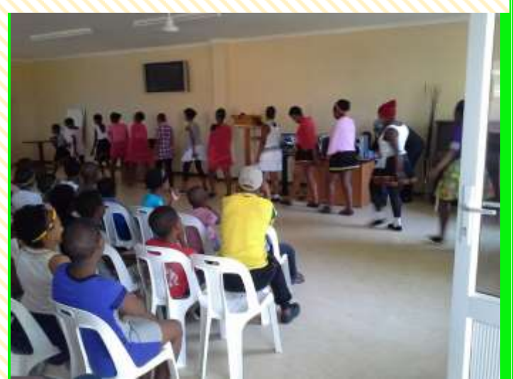
Children from our Child & Youth Care Centre expressed their heritage through song and dance

CWDD Child and Youth Care Centres Celebrated heritage day through various activities.