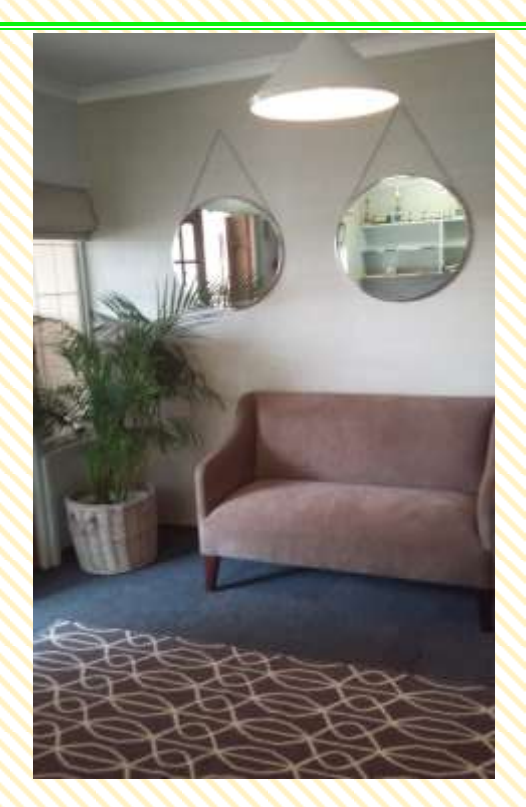
The new reception area