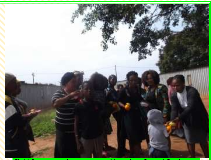
Child Protection Awareness at Uganda informal Settlement

"The purpose of life is not to be happy. It is to be useful, to be honourable, to be compassionate, to have it make some difference that you have lived and lived well."- Ralph Waldo Emerson