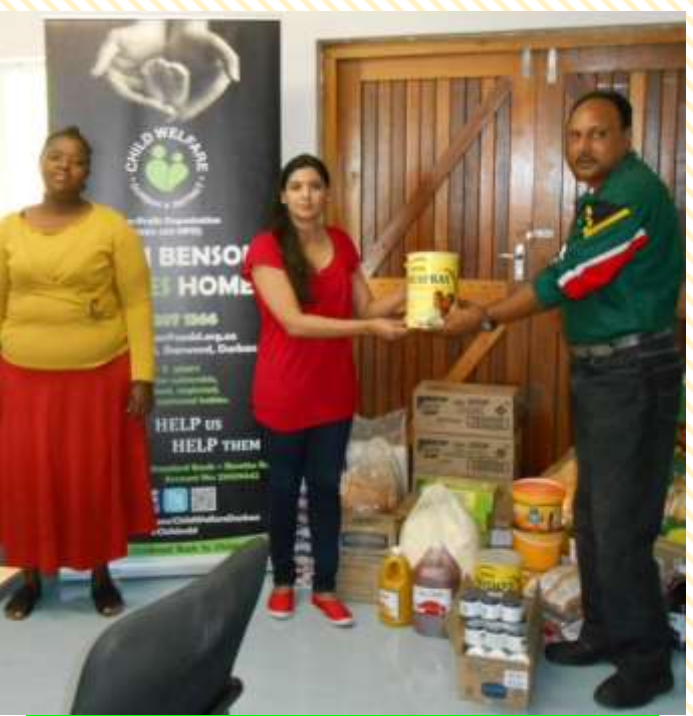
Generous donation of groceries for our 237 children