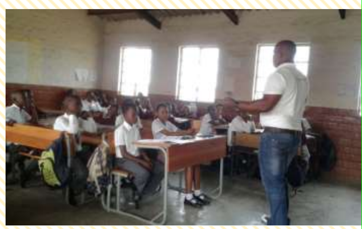
"The great aim of education is not knowledge but action."-Herbert Spencer