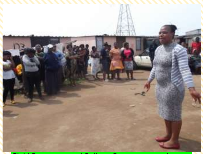
Child Protection and Bullying Programme at Isipingo Transit camp

"The purpose of life is not to be happy. It is to be useful, to be honourable, to be compassionate, to have it make some difference that you have lived and lived well."- Ralph Waldo Emerson